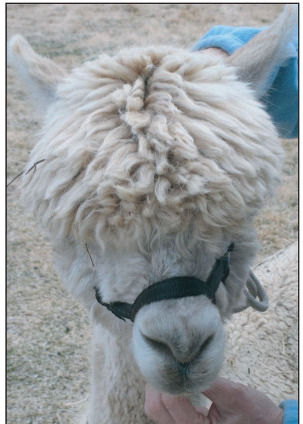
Another view of the way that the nose band of the badly-fitting halter compresses the cartilage.

Alpacas eat or ruminate most of the day. Assuming that jaw movement is required for both of these activities, it is probably safe to guess that the jaw moves side to side once every second or two for half of their waking hours. My math gives me approximately 7,200 side-to-side movements per day – and that is a lot of chewing. Put a halter on until the nose band won't go any further; as in putting a ring on a cone,