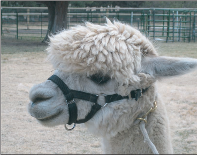
This halter does NOT fit. It is restricting the animals ability to chew and is not resting on bone but on cartilage.

Behavioral problems such as kicking, spitting, and rebellious cushioning can be and often are related to halter fit.