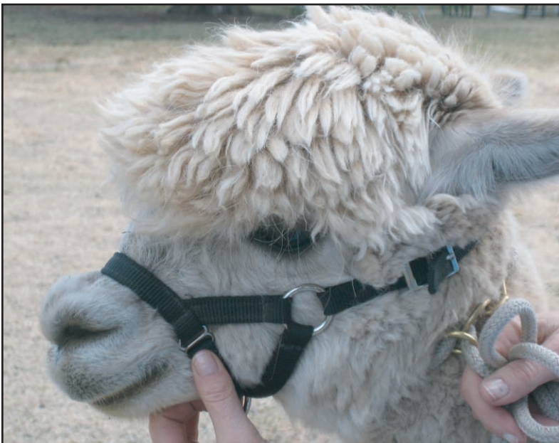
You can see what happens when a halter that is fitting in this way is actually used to control the alpaca the cartilage is compressed and the airway is compromised. When taking these photos I could hear the sound of her breathing become much louder and more obvious.

feature adjustments in both of these loops, whereas others are sized according to the size of the noseband (a bad idea).