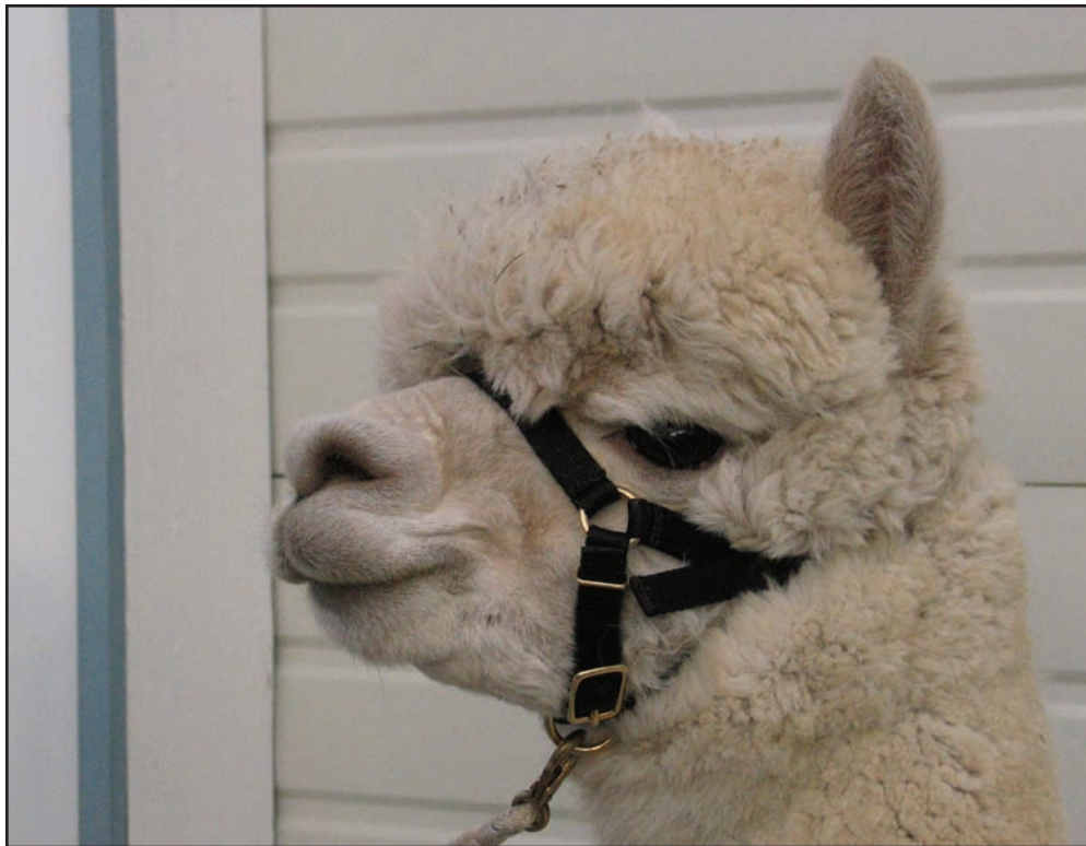
A halter that fits well is essential to the health, well-being, and good behavior of your alpaca.

that perfectly good opening called a mouth, but it is almost entirely for eating (more on that later). An alpaca can die if his nasal passage is blocked. Because of this, ANY suggestion that the halter may slip forward is going to frighten the alpaca. Imagine that someone is pushing your head slightly under water, if you tilt your nose just right you can still barely breathe but you begin to panic and struggle. Your tormentor is thinking “just settle down and cooperate and I will lighten up.” Alpacas or humans that even think that they can’t breathe will panic.