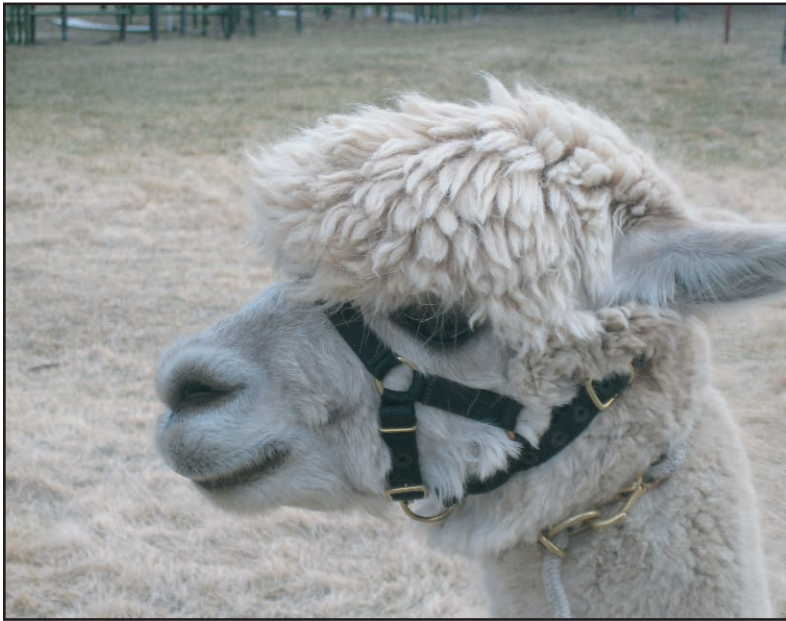
This halter fits! You can see that it must be right up close to the eye in order to be fully on the bone. Notice too that the noseband is not compressing the cartilage or the skin around the mouth. This alpaca still has full mobility when she chews. Notice that when I pull down on the bottom of the halter (right) the nose bone supports the halter and does not compress the cartilage.