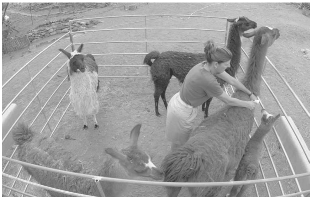
Notice in this photo that the animals are all heading in the same predictable direction. Reaching across the animal to give the injection on the side away from the handler makes it much easier to control the direction.

The trick to giving injections without restraining the animal is to be adept at influencing which way the animal moves. In this way you can move with the animal as you continue giving the injection. Stand at the center of the pen and approach your "injectee" from behind the eye. Walk directly to the animal, reach across the body to the opposite side (see following de-