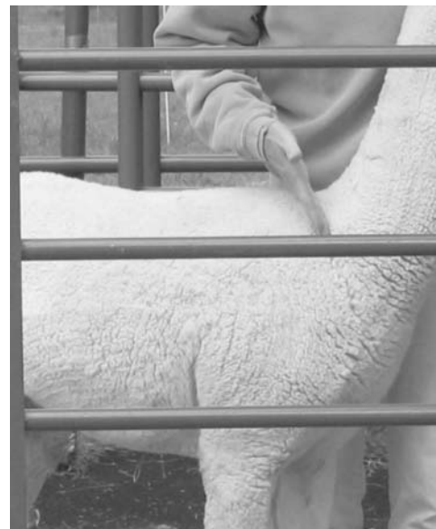
The handler is pointing to the line where the shoulder meets the neck. This groove has loose skin and is an easy place to give a subcutaneous injection.

reaction and is an easy place to treat in the unlikely event there is a reaction to the medicine.