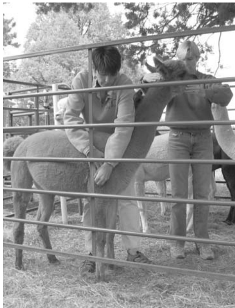
In this photo the handler is using the bracelet to steer this alpaca as the other handler gives an injection. This photo also illustrates the location for an intramuscular injection.

you may need to use injection sites all over the body including the rear half. A sick llama or alpaca is not